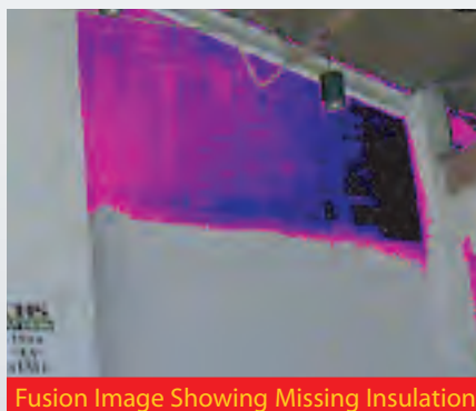
Fusion Image Showing Missing Insulation