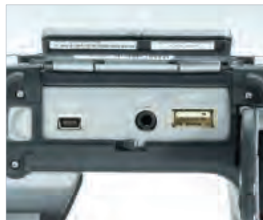
From Left to right: USB mini for PC image download, NTSC video, USB-A for memory stick image transfer