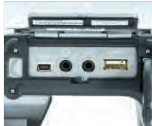
From Left to right: USB mini for PC image download, 4 pole audio for voice annotation, NTSC video, USB-A for memory stick image transfer